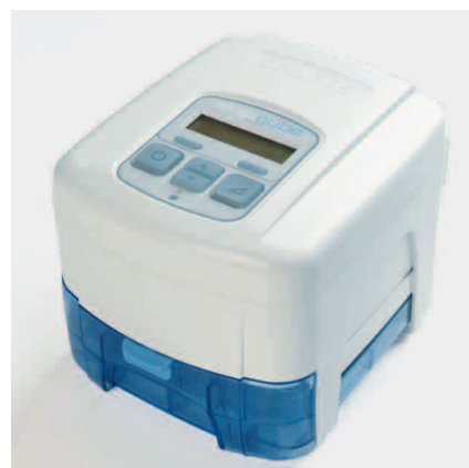
SleepCube with integrated heated humidifier