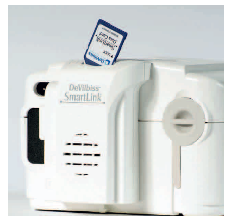
SleepCube AutoBilevel with SmartLink unit attached