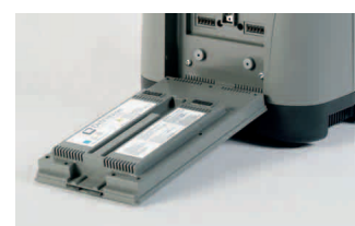
iGo Lithium ion Battery