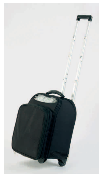
Wheeled carry case showing extendable handle