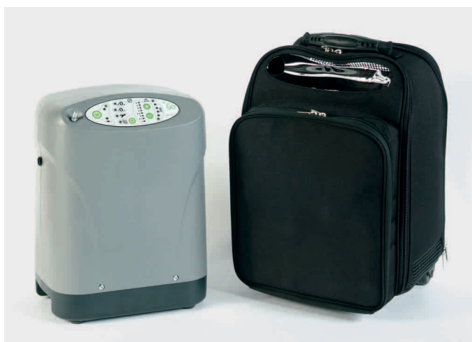
iGo and wheeled carry case